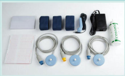
Ultrasound doppler probe 2ea, UC probe 1ea, Event marker 1ea